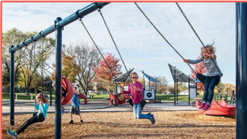
Single Post Swingset

The Single Post Swing is elegantly simple, as well as an economical choice for your outdoor playground. No playground is complete without a swingset, and the Single Post Swing is an easy, space-saving choice to add an extra play element that children love. Swinging is a sensation that children seek. It stimulates their brain as well as their body, helping them learn balance, spatial awareness and rhythm. And it strengthens their core muscles so they benefit from swinging in multiple ways.