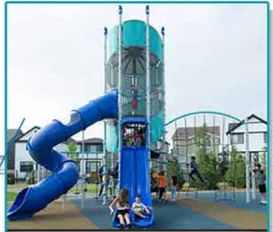
Super Net-plex 12'Tower https://youtu.be/6vPmmekgquM