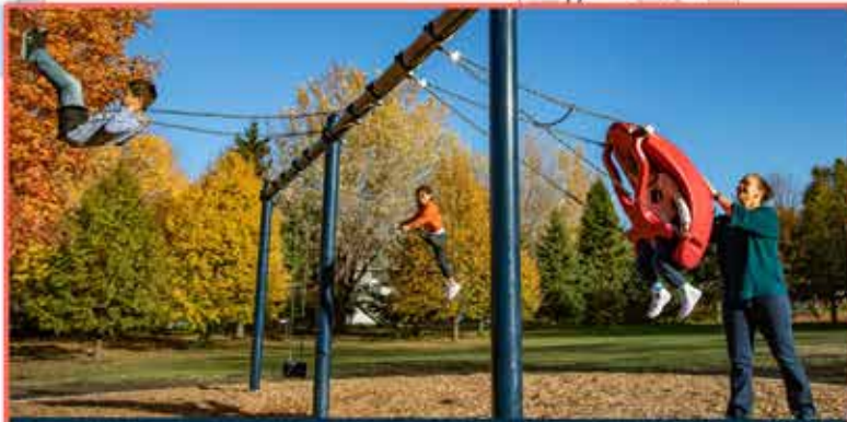
Single Post Swingset

To see the Super Net-Plex and We-Go-Round in action go to youtube and use the links on the photo.